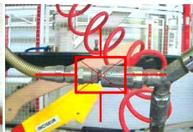
#51 13,3dB Gain:82 - 19/06/13 01:20:39